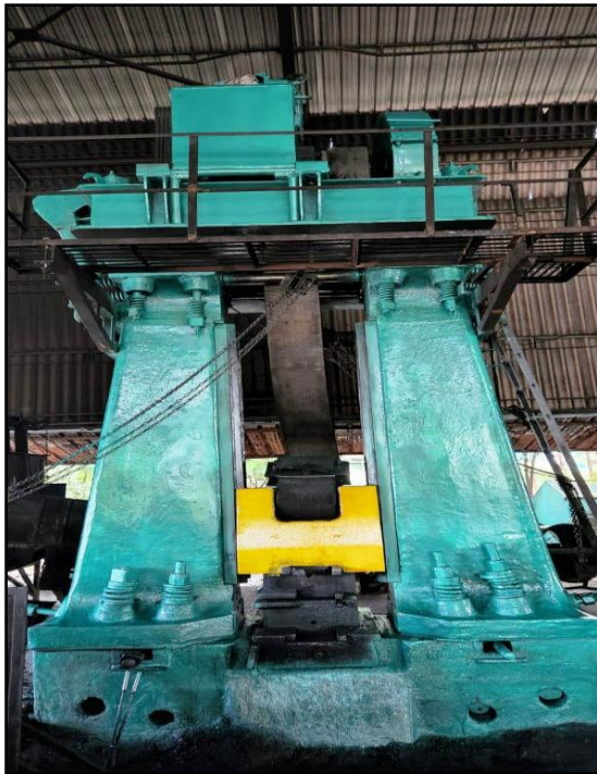
BELT DROP HAMMER 1.5 T