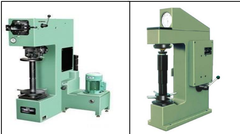
JOMINY END QUENCH TESTING